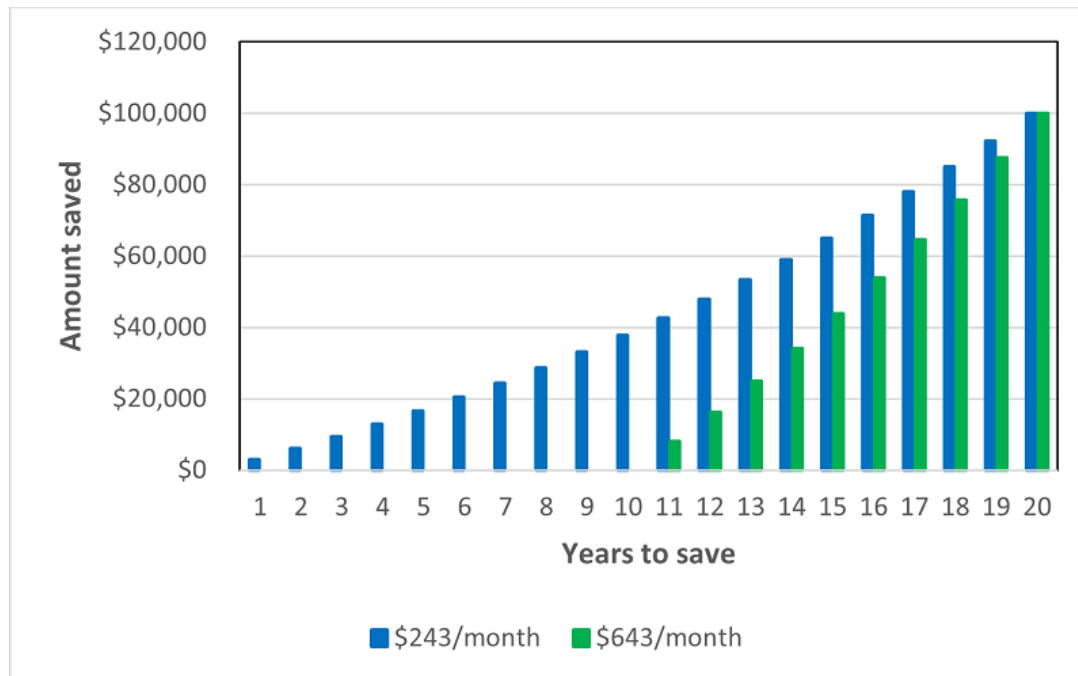
Table 2-2 How Starting To Save Early Means You Need To Save Less Each Month (Financial Consumer Agency of Canada, Jan. 17, 2024)